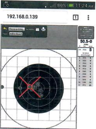
4 Electronic scoring is the latest innovation – this is a 900 yard target indicating bullet impact and velocities.